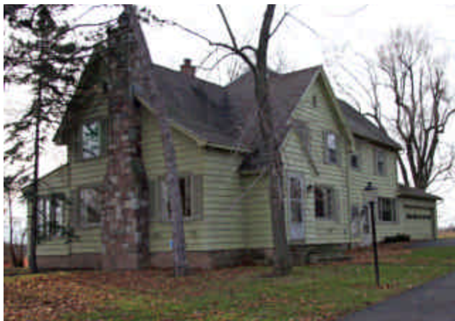
1575 Winton Road South

To handle the growing demand for service and address limitations at the current Base, it was concluded that alternatives would be required to fulfill our mission to the Brighton community. In the midst of this process, our neighbor decided to sell their property. Subsequently, a recommendation was made to the Board to acquire the property at 1575 Winton Road South, which would provide us the future opportunity to have additional land available. The Board voted to acquire the property and BVA took possession in late 2005.